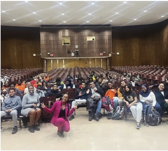
Students from Queens Prep Academy & Excelsior Prep present their civic engagement projects during Civics Day.