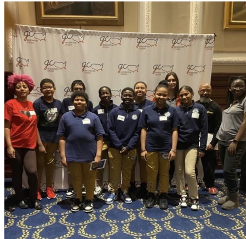
Student & teacher representatives from Urban Assembly Academy for Future Leaders join as community advisors for Civics Day.