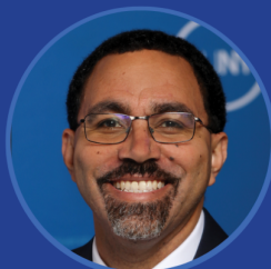
John B. King, Jr., J.D., EdD SUNY Chancellor and Former U.S. Secretary of Education