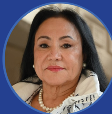
Betty Rosa, EdD NYS Commissioner of Education