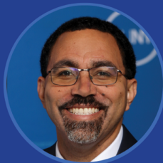
John King, EdD SUNY Chancellor and Former U.S. Secretary of Education